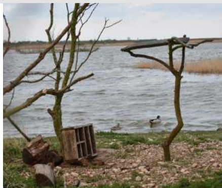
Frampton Marsh by Martin Reynolds

Grazing through social media in a spare moment, I came across a debate on council chains of office, the cost, and necessity. I'm not suggesting existing chains of honour are melted down and sold for funds but in this day and age do we really need to purchase new or replacements? When I need people to know who I am, I wear a small badge with my name and position, this is low cost, and when we struggle with funding for street lighting, grass cutting, policing, road maintenance, schooling, no contest in my