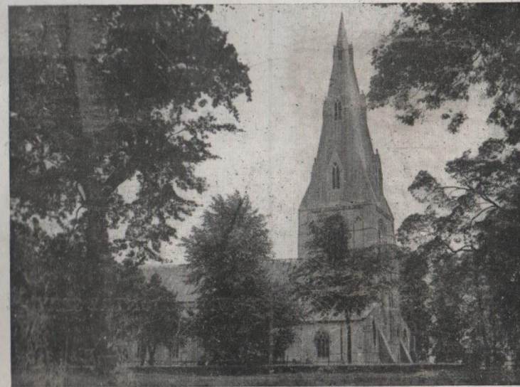
PARISH CHURCH OF S. MARY THE VIRGIN, FRAMPTON