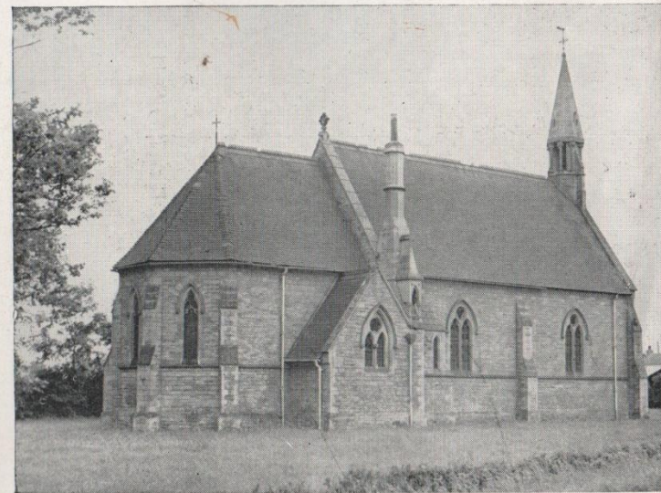
CHURCH OF S. MICHAEL AND ALL ANGELS, FRAMPTON WEST

S. Mary the Virgin with S. Michael and All Angels Frampton