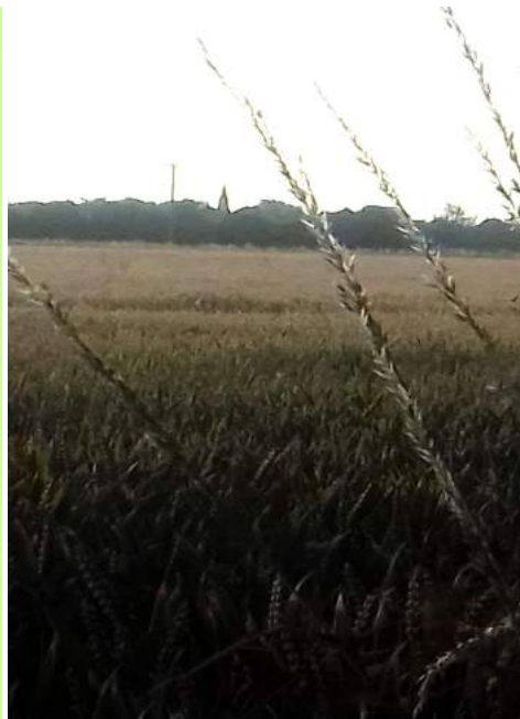
Start of a New Dawn