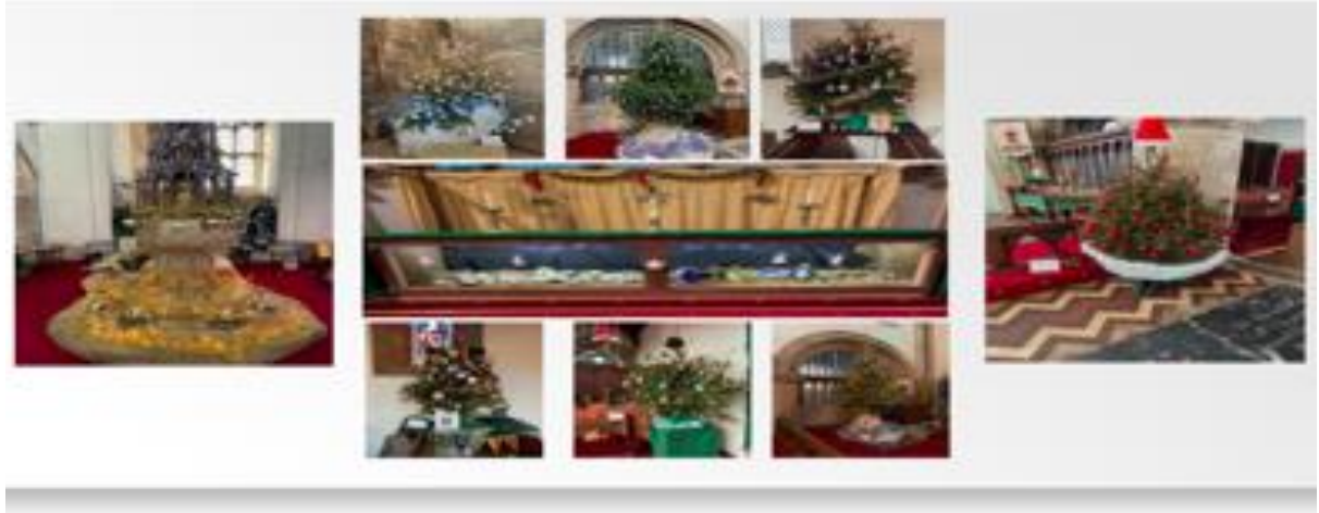
Christmas Tree Festival.

The Church is best known for its Christmas tree festival, Arts festival and Heritage weekend events and provides valuable ministry in a weekly social coffee morning every Thursday from 10am to 12pm.