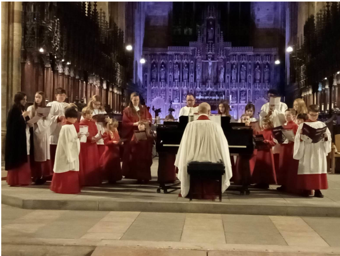
The choir ready for the Mayors Service in December 2022